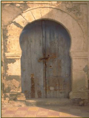
Jesus is the door to your Salvation