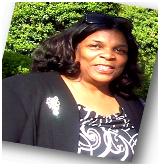
By Minister Victoria Patterson